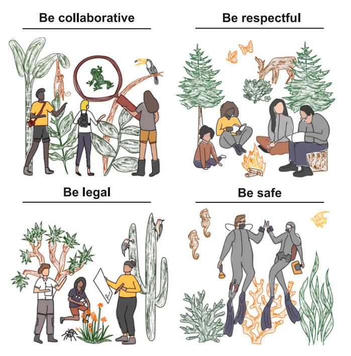
Fig. 1. Four principles to promote equitable fieldwork. Illustrations by Camila Pacheco Bejarano.

awareness about how field activities affect other people(s) and communities, especially in contexts where preexisting power imbalances and implicit biases exist. We note that the principles and suggestions described herein are derived from experiences mostly in the context of academic and natural history museum settings, and mostly involving researchers from the United States (SI Appendix, Positionality Statement). Fieldwork is diverse and involves many different types of communities and cultures, and not all of our suggestions are appropriate or feasible in every circumstance. However, we envision that the content of this perspective can apply to an array of scientists who conduct field research within their home country or internationally, especially when working in locations where local communities and/or scientists are less privileged than the organizing institution. To facilitate following the proposed principles, we provide a set of potential actions and considerations, an overview of permitting processes, a field safety plan template, and a set of open questions that arose during the creation of this document (SI Appendix). Intentional planning that emphasizes inclusivity and equity in field biology is fundamental to the set of principles proposed herein.